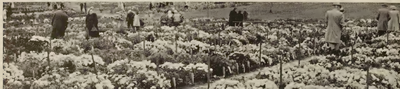
Visitors strolling through our test garden in late October